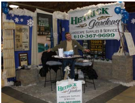
3rd BEST OF SHOW: Hetrick Gardens Landscape & Nursery Center