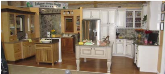
BEST OF SHOW and 1st Place People's Choice: Luicana Unique Design

Special recognition was awarded the following vendors for bolstering the show's draw with exceptional marketing: