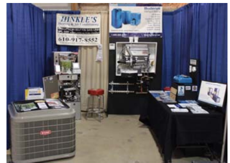
3rd Place People's Choice: Hinkle's Heating & Air Conditioning, Inc.

The following BIE member companies that promoted their businesses and the association with signage at the show: