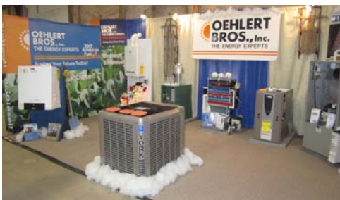
4th BEST OF SHOW: Oehlert Bros., Inc.