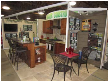
2nd BEST OF SHOW and 2nd Place People's Choice: Schumaker Construction